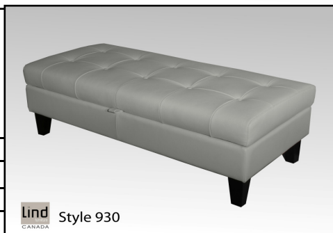
Lind CANADA Style 930