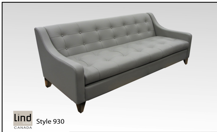
Lind CANADA Style 930

Contemporary style: Buttoned back, loose seat cushion is also buttoned. Storage bench: handle can be hidden inside, spring loaded hinges, extra storage on the back of the lid.